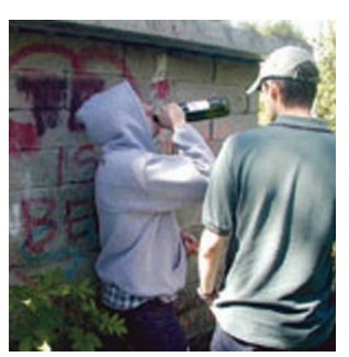
Underage drinking is a common example of anti-social behaviour.

The inspection identified some weaknesses that existed in the collection and monitoring of information on the effectiveness of ASBOs and a recommendation was made to address this.