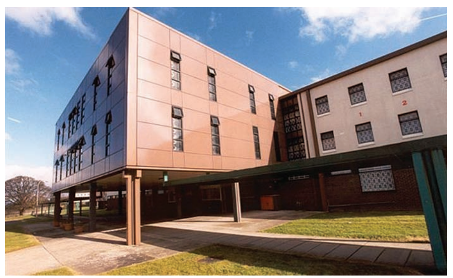
Hydebank Wood YOC.

The inspection team were also concerned to discover a number of incidents of apparent bullying within the YOC that had never been fully investigated.